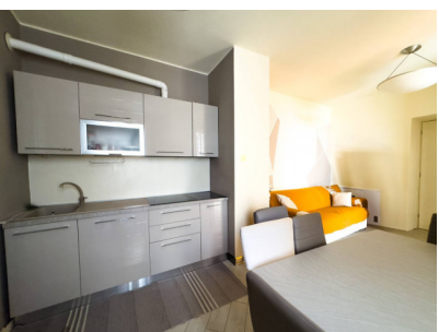
RIF. 13970 - PRICE: € 278.000 - MQ 81

Bordighera, three-room apartment near the sea! Independent three-room apartment 300 meters from the sea. Just 5 minutes by foot from the train station, we offer for sale a comfortable three-room apartment, recently renovated in 2019, located on the ground floor of a small building with no condominium fees, close to the center and all servises. The property, with double independent entrance, has a nice private open space, ideal for moments of relaxation outdoors. The internal distribution includes: hall, large double bedroom, second bedroom, hallway, bathroom with window and shower, living room with open kitchen and practical closet/laundry room, complete with washing machine and sink. Heating system is autonomy with heat pumps, air conditioning and awnings in the private courtyard